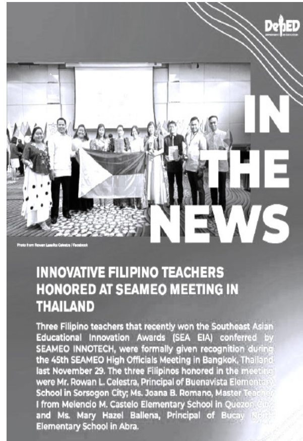
INNOVATIVE FILIPINO TEACHERS HONORED AT SEAMEO MEETING IN THAILAND